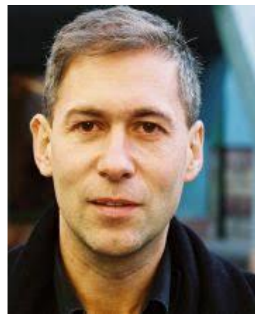
Kai Konrad Max Planck Institute, Munich